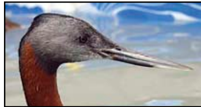
Great Grebe, Argentina

Because time has moved so quickly this year we decided to fill you in on what we have been up to. We hope this will inspire you and inform you. Most importantly, we want you to know that it is because of your support and kindness we have been able to do this important work. For this, we are very grateful.