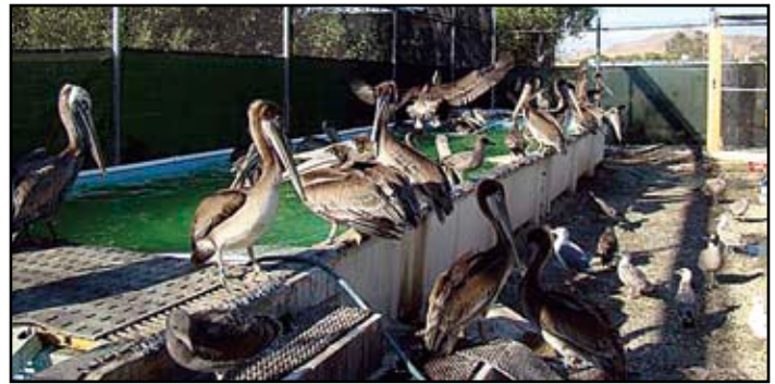
New: A 100-foot flight aviary at the Fairfield center allows us to care for more pelicans.

The influx of pelicans was taxing our centers, as the San Pedro facility was also receiving unusually large numbers of pelicans in their clinic. Our fish bill alone climbed to nearly $40,000. When we continued to see injured birds, an urgent appeal was sent to our membership, who graciously responded by helping us with much needed funds.