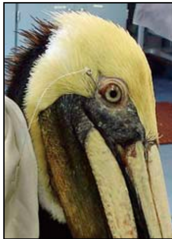
Ouch: A Brown Pelican caught with fish hook in its eye. It was treated and released.

In 2002 we built a pelican flight aviary approximately 95 feet long, 15 feet high and 30 feet wide at our Southern California center. This aviary was unique as it was the only aviary in California that can house over 50 pelicans at a time. In seven years it has served as a rehabilitative aviary for over 1,000 Brown and White Pelicans and many other seabird species including Cormorants, Terns, Gulls, Frigatebirds, Albatross and Boobies. Our Northern California rehabilitation center had not been able to similarly meet the need for appropriately housing pelicans. This center services all of the San Francisco Bay area and surrounding coastal regions.