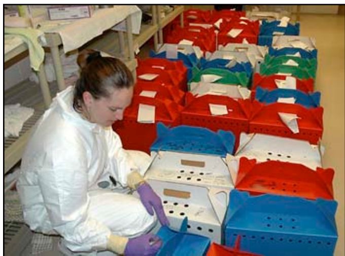
Oiled bird boxes: Working in the "Hot Zone" an oil spill response worker checks in birds caught in the aftermath of the Cosco Busan spill. The November 7, 2007 spill brought more than 1,000 birds into the San Francisco Bay Oiled Wildlife Care and Education Center in Fairfield, CA. More than 421 birds were released back to the wild.

The Cosco Busan kicked the OWCN, IBRRC and its other members into action. For active oil spill responders like us it was business as usual, in a sense. We always attempt to maintain a calm but urgent approach to these types of emergencies so that we stay in good mental and emotional health for the long haul. With this spill occurring in our backyard, an increasingly concerned public growing volatile began injecting themselves into all aspects of the response. This was due to poor communication from the top level of the command structure. Limited informa-