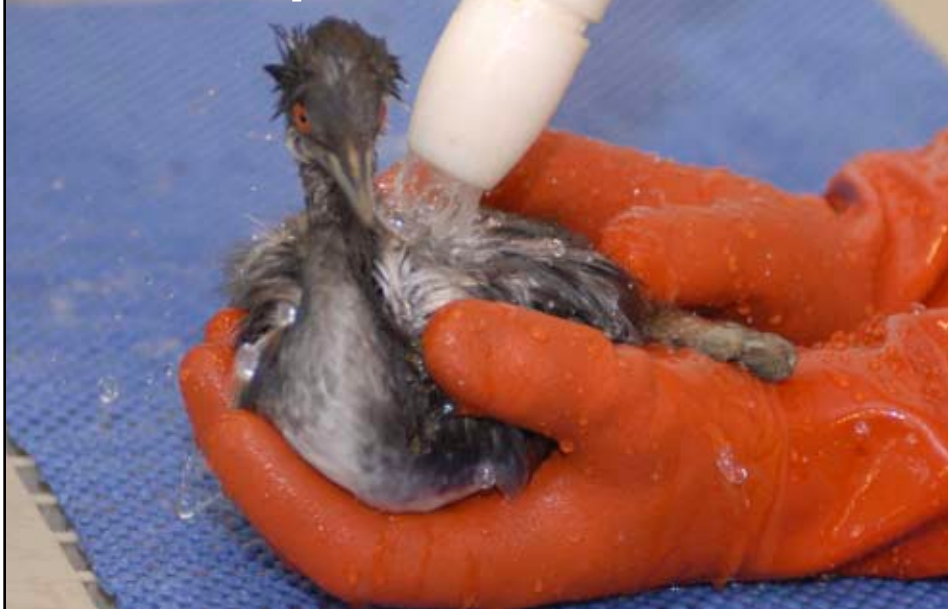
Tiny victim: An Eared Grebe is washed of oil at IBRRC's bird center during the November 2007 spill that hit San Francisco Bay. A container ship spilled more than 50,000 gallons of oil.