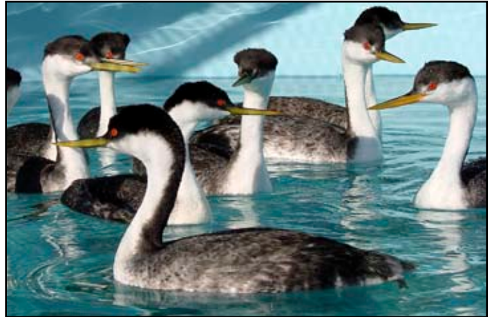
The tide turns: The majority of birds treated included Clark’s and Western-Grebes. They recuperate in IBRRC pools at Cordelia center.

No evidence was found to suggest that it was a petroleum product, fish or vegetable oil, or related to the “Checkmate” product used to spray for light brown apple moths. It’s cause is still uncertain: It could be weather pattern changes, fertilizer runoff