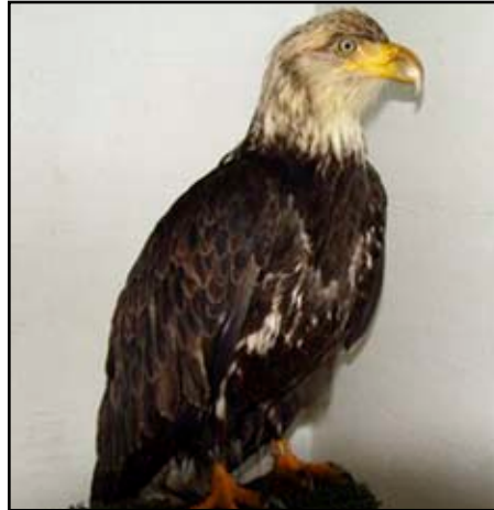
Eagles on the mend: Bald eagles rests at Anchorage, Alaska bird center. salmon, one hundred pounds a day, that the eagles would need while in care.

When the AWRC is not being used for oil spills, it is utilized by Bird TLC a non-profit organization dedicated to helping sick and injured birds in need. Bird TLC's staff and volunteers also sprang into action, readying the center for the arrival of such important patients, turning up the heat to 80 degrees so the birds would be warm and arranging for the