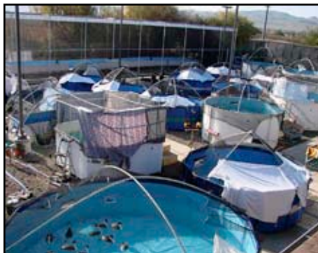
Room for birds: Extra pools were filled with cleaned birds after being washed of oil.

For our newer members and supporters who maybe don't know the history of oiled wildlife response as a field of work and how, in many ways, it is firmly rooted into the San Francisco Bay area, here is a brief overview. In 1971, the Oregon Standard collided with another ship under the Golden Gate Bridge. This resulted in a massive spill of crude oil that left over 7,000 live oil covered birds in the hands of well meaning but unqualified volunteers that worked out of any building they could find that had a roof on it. All but a few of those birds died and IBRRC became part of that spill's "silver lining". IBRRC, in fact, set in motion the initial research