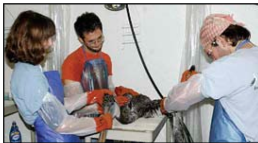
Wash room help: Volunteers worked with cleaning oiled birds, such as this pelican.

If we look at who responded during the spill, 450 of these indi-